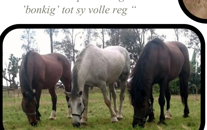
Van ons percheron sportperde

"Lacoté Cheval-Vapeur bring die woord 'bonkig' tot sy volle reg "